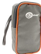
S1 carrying case WAFUTS1