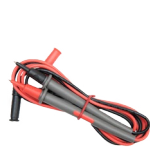
Test leads set for CMM (CAT IV, S) WAPRZCMM1