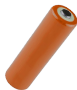
2x LR03 AAA 1,5 V battery