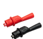
Crocodile clip mini, 1 kV 10 A (set) WAKROKPL10MINI