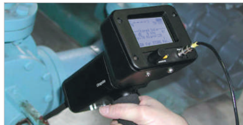
Test/Trend all types of machinery

Ultratone. A unique method that is also employed for heat exchangers is the "Ultratone" method in which a powerful high frequency transmitter floods the shell side of the exchanger with ultrasound. The generated sound will follow the leak path through the tube. A scan of the tube sheet will indicate the leaking tube.