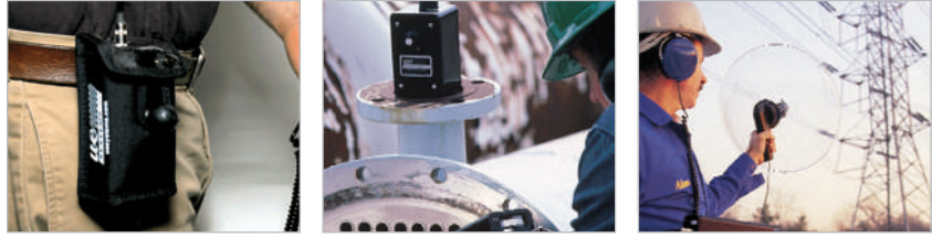
Accessories for enhancing test procedures available