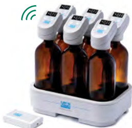
RESPIROMETRIC Sensor System - BOD 6 positions - Results on display and RESPIROSoft™