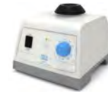
ZX3 Electronic speed regulation: Up to 3000 rpm