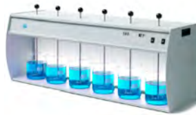
JLT 4 AND JLT 6