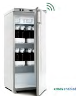
FOC 200 E Connect From 3 to 50 °C