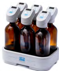
BOD Sensor System 6 - 10 positions - Results on display