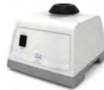
RX3 Electronic speed regulation: Constant 3000 rpm