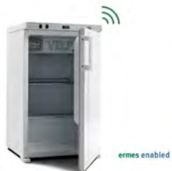
FOC 120 E Connect From 3 to 50 °C