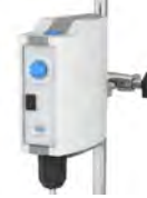
PW Up to 70 L