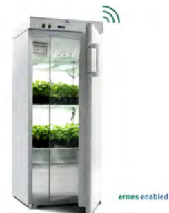
FOC 200 IL Connect From 3 to 50 °C