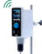
ermes enabled OHS 200 Advance Up to 100 L