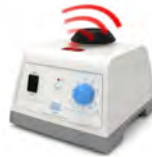
ZX4 Electronic speed regulation: Up to 3000 rpm