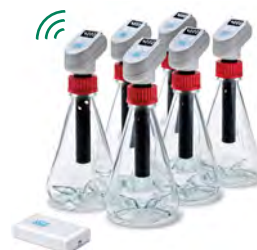
RESPIROMETRIC Sensor System for Soil Analysis Results on display and RESPIROSoft™