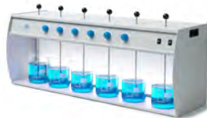
FC4S AND FC6S