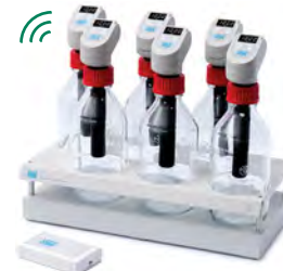
RESPIROMETRIC Sensor System MAXI - BMP 6 positions - Results on display and RESPIROSoft™