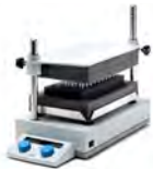
MULTI-TX5 Digital Electronic speed regulation: Up to 2500 rpm Integrated timer