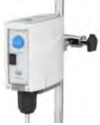
ES Up to 15 L