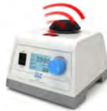
TX4 Electronic speed regulation: Up to 3000 rpm Integrated timer