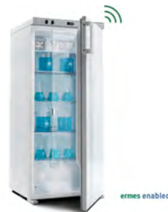
FOC 200 I Connect From 3 to 50 °C