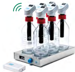
RESPIROMETRIC Sensor System for Plastic Analysis 6 positions - Results on display and RESPIROSoft™