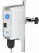
LS Up to 25 L