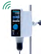
ermes enabled OHS 100 Advance Up to 100 L