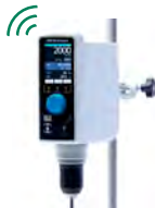
ermes enabled OHS 60 Advance Up to 40 L