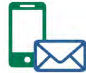
HELP-DESK AND REMOTE SUPPORT