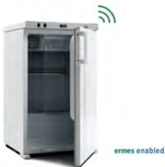
FOC 120 I Connect From 3 to 50 °C