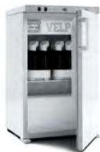
FOC 120 20°C constant