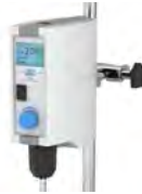
DLS Up to 25 L